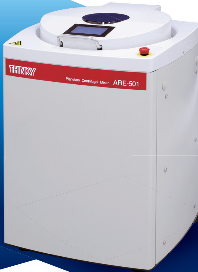
■ Option stand