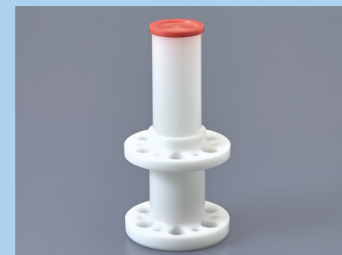
6 oz. Barrel adaptor