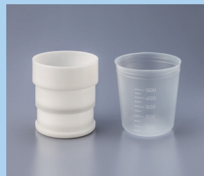
500ml Disposable Cup